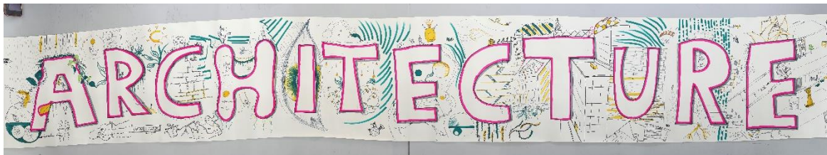
Note. A section of the collaborative drawing workshop degree show banner after completion. Own work.

Following the workshop, surveys were completed by the participants, consisting of 12 quantitative and one qualitative question ( How do you think the collaborative drawing activity could be improved? ), alongside a space for additional comments. Questions such as 'Could collaborative drawing help create a stronger sense of belonging' and 'could collaborative drawing help build confidence for submissions' were asked to members of the society. The focus group took place straight after the workshop, involving the same 17 participants as the workshop. All data and percentages are taken from the 17 participants. Although a focus group of 17 participants is a significant amount of people for a group discussion, there were opportunities for all students to share their views. The session was facilitated by Mills who ensured that everyone had the opportunity to talk whilst, Payne scribed the discussion and prompted Mills where