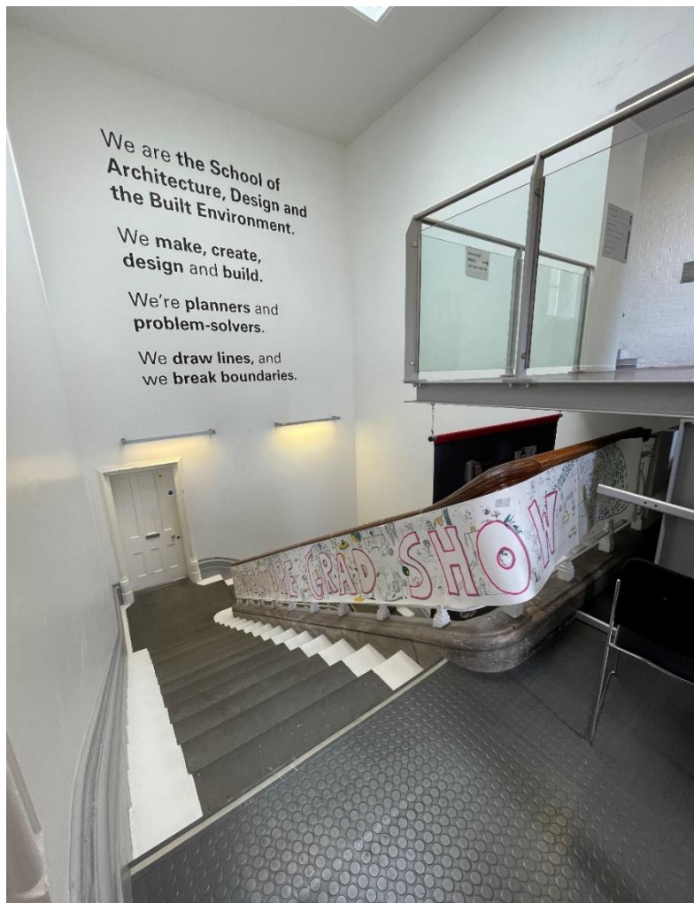
Figure 5 Degree show banner

Note. Collaborative drawing workshop degree show banner on display at NTU. Own work.