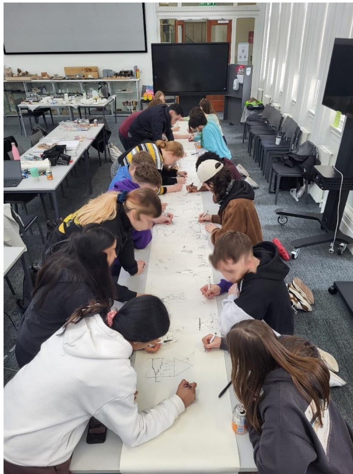
Note. View of the collaborative drawing workshop in progress. Own work.